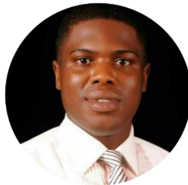
Kingdom Linus Nigeria